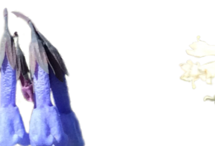
Ribes cereum Wax Currant Mertensia longifloria