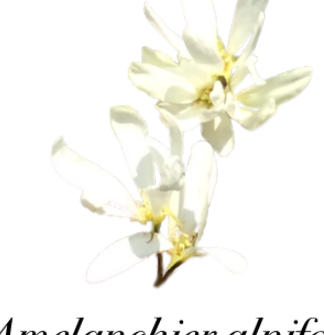
Amelanchier alnifolia Western Serviceberry