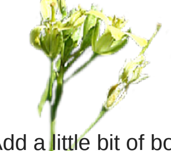
Add a little bit of body text Sisymbrium altissimun Tall Tumblemustard