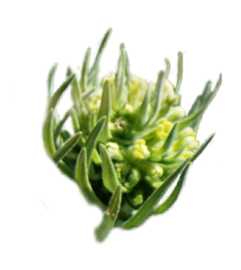
Lithospermum ruderale Columbia Puccoon