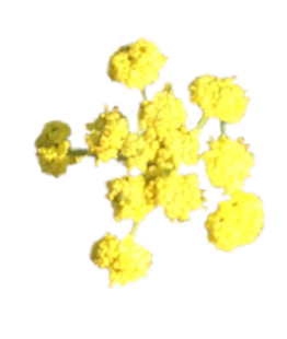
Lomatium nudicale Barestem Biscuitroot