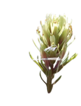
Castilleja thompsonii Thompson's Paintbrush