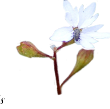
Lithohragma parviflorum Bulbous Prairie-star