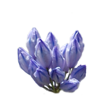
Mertensia grandiflora Douglas' Brodiaea