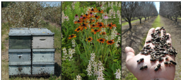
Honey bee colonies in blueberries, Rufus Isaacs. Habitat for wild bees, Don Kiersted (NH USDA-NRCS). Blue orchard bees and almonds, Derek Artz.

With Project ICP's strong economic and social components, we are assessing how best to fit these ICP strategies into different scales of crop production, as well as how best to share project results with specialty crop growers nationwide to achieve meaningful adoption.