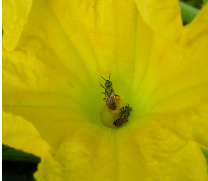
Sweat bees in squash flower