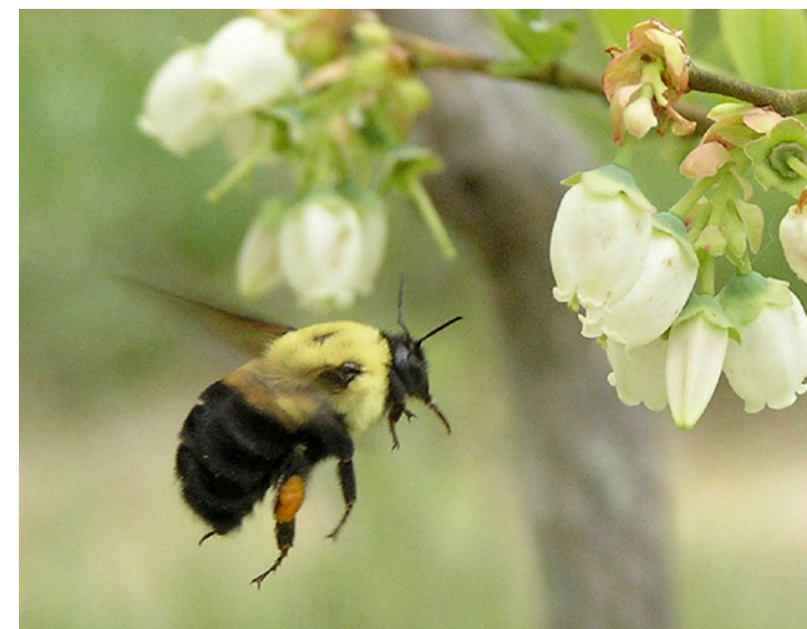
Bumble bee on blueberry blossoms, Nancy Lee Adamson.

Bees are essential specialty crop pollinators. Managed bees, such as honey bees, along with bumble bees and other wild bee species are under threat and their populations are declining. Growers need strategies that can reliably deliver pollination to ensure a profitable return from pollinator-dependent specialty crops. To meet these grower needs and ensure reliable pollination, Project ICP is conducting research and extension nationwide on farm management practices that increase wild bees and on techniques for managing alternative bees for pollination.